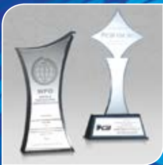
World Acclaimed Award Winning Packaging Solutions