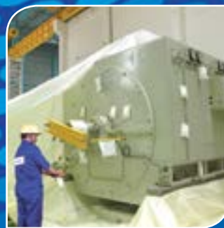
P2P (Point to Point Solution) - Packaging on turn key basis for exports